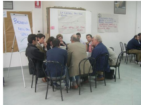
attend it again